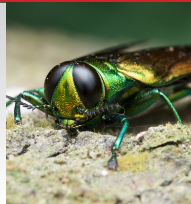
PERCENT THINNING OF ASH TREES · LAYFAYETTE, IN

Treat the tree with ArborMectin to prevent the Emerald Ash Borer from harming or killing the tree.